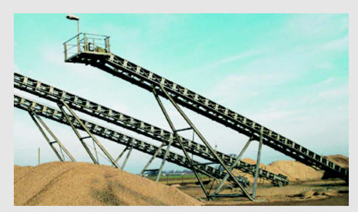
V- support with skids