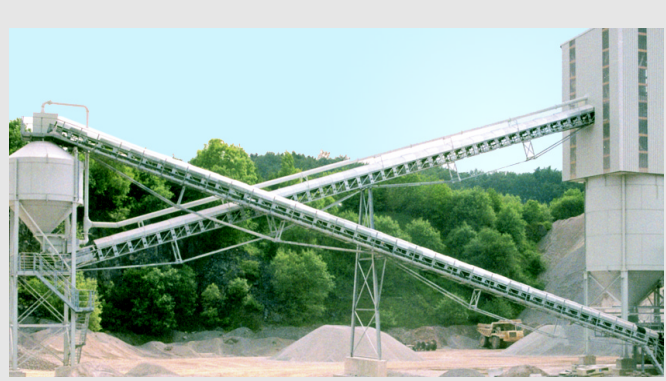
large support radius with bracing