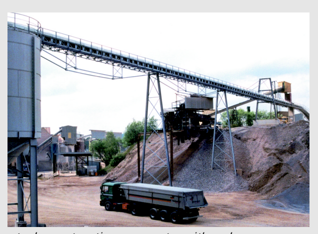
steel construction supports with pylon