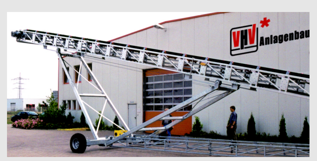
swivelling undercarriage adjustable in height