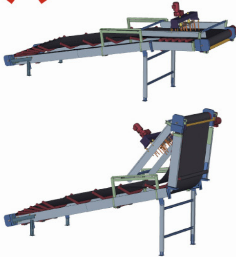
Hinged without having to disassemble the mixer plates